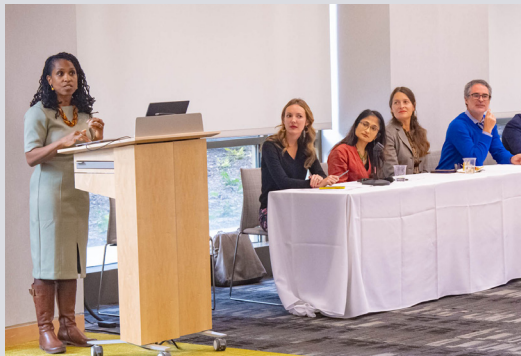
The newly-launched Center for Environment, Community, and Equity is a network of cross-disciplinary faculty working toward a more just and sustainable world.