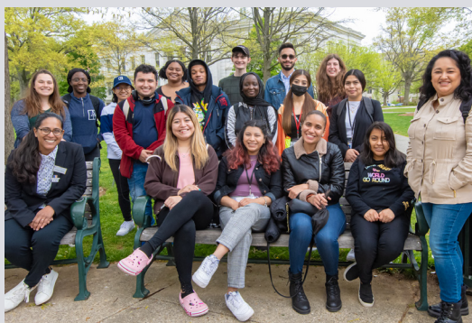
Latin American Youth Center Career Academy students join AU Eagles for a tour of campus as part of a signature partnership between the DC charter school and the university.