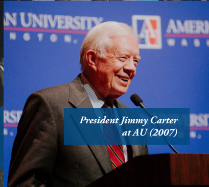
President Jimmy Carter at AU (2007)