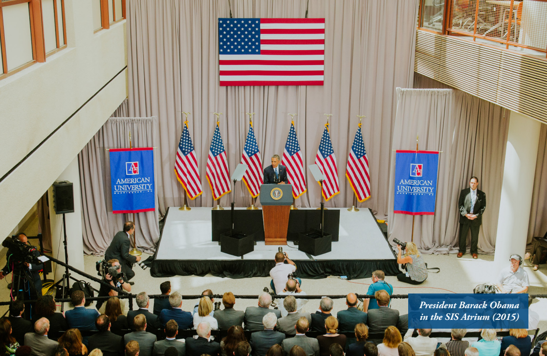
President Barack Obama in the SIS Atrium (2015)