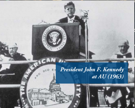
President John F. Kennedy at AU (1963)