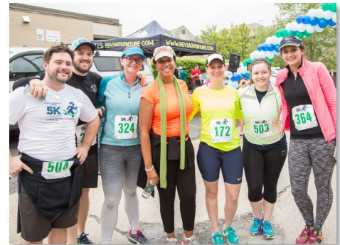
DC Mayor Muriel Bowser races to representation!

True The number of runners who didn't have fun AND learn about women's representation was zero.