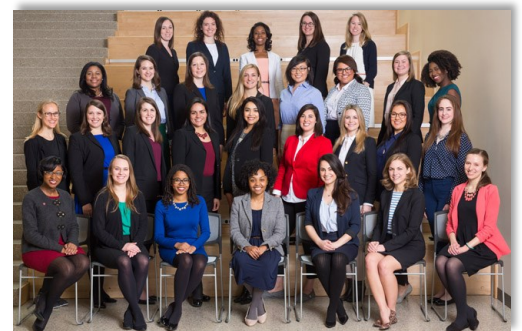
A group photo of the bipartisan WeLead Class of 2015-2016.

False Participants thought there was significant room for improvement in the program.