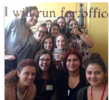
Explore DC participants at the actual Sewall-Belmont House and Museum.

What size tax-deductible gift would you like to make to the Women & Politics Institute?