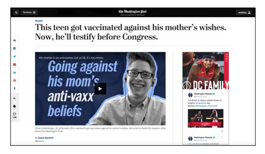
Front Page of the Article