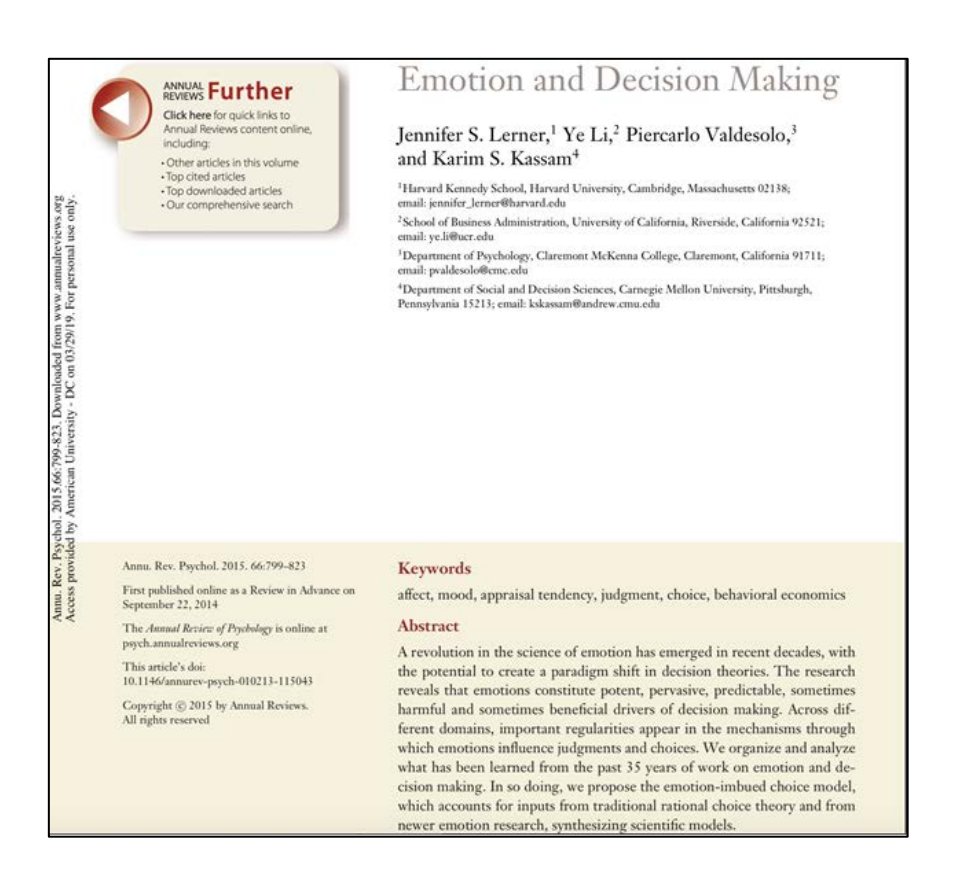
First Page of Article

5. The main issue with this article is that I will need to make linguistic adjustments to a few of the questions I want to use, due to the scientific nature of the writing. I want to actively improve on writing more accessibly and at a reading level a wider audience can appreciate, so this article will be somewhat of a challenge to parse down.