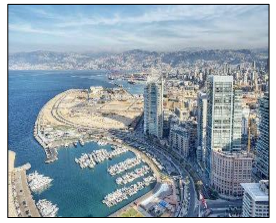
Beirut, Lebanon.