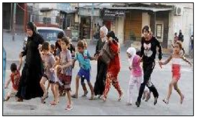
Deadly Clashes Hit Palestinian Refugee Camp in Lebanon, 2015.

knowing a single thing about Lebanon. Sometimes I would just break the ice by saying, "Oh, but I have a house in L.A too!" To others, I would just say, "Yeah... Well, I'd love to visit Tel Aviv, without getting imprisoned by my country!" The challenge was smiling at my Israeli peers and pretending that I didn't notice the awkwardness filling the room when we had to introduce ourselves. I believe that the biggest challenge was to put aside the continuous slideshow that my brain would create when someone from Israel would say, "I wish I could visit Beirut, I hear it's beautiful."