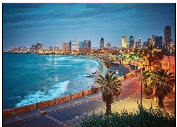
Tel Aviv, Israel.