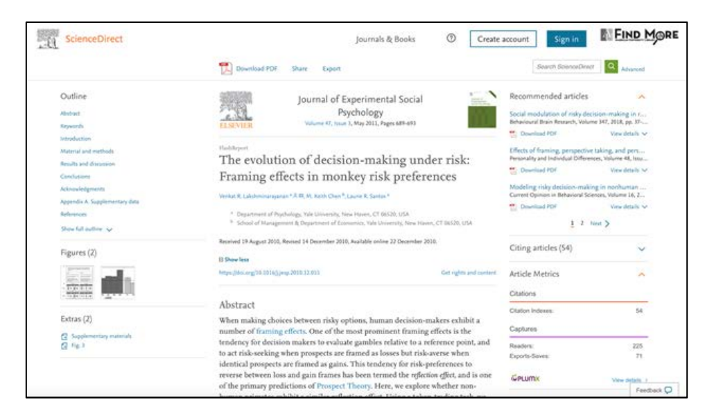
First Page of Article