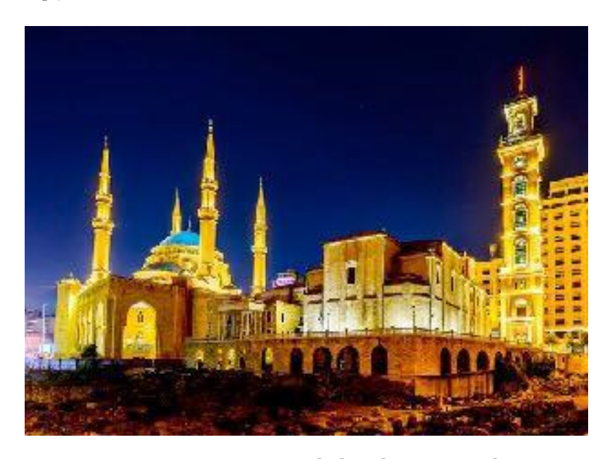
Jazziam. Downtown Mosque and Church -Beirut. Lebanon, 17 June 2017.

One of the outcomes of that experience is the text I am starting to write to my dad: "Hey Dad! In case you receive a government alert about your daughter's Lebanese citizenship being taken away, please know that this experience was very fruitful. Believe it or not, these people I met are just young adults, living their college life just like I am, probably having spent hours on this writing assignment with a Red Bull pack to keep them up just like I did."