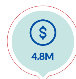
Total Aid (USD)