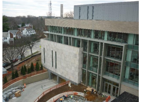
Garage entrance and Nebraska Wing