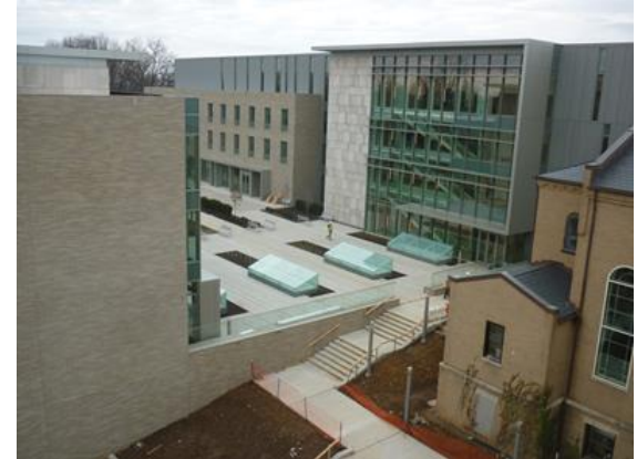
Terrace/roof deck and Yuma Wing