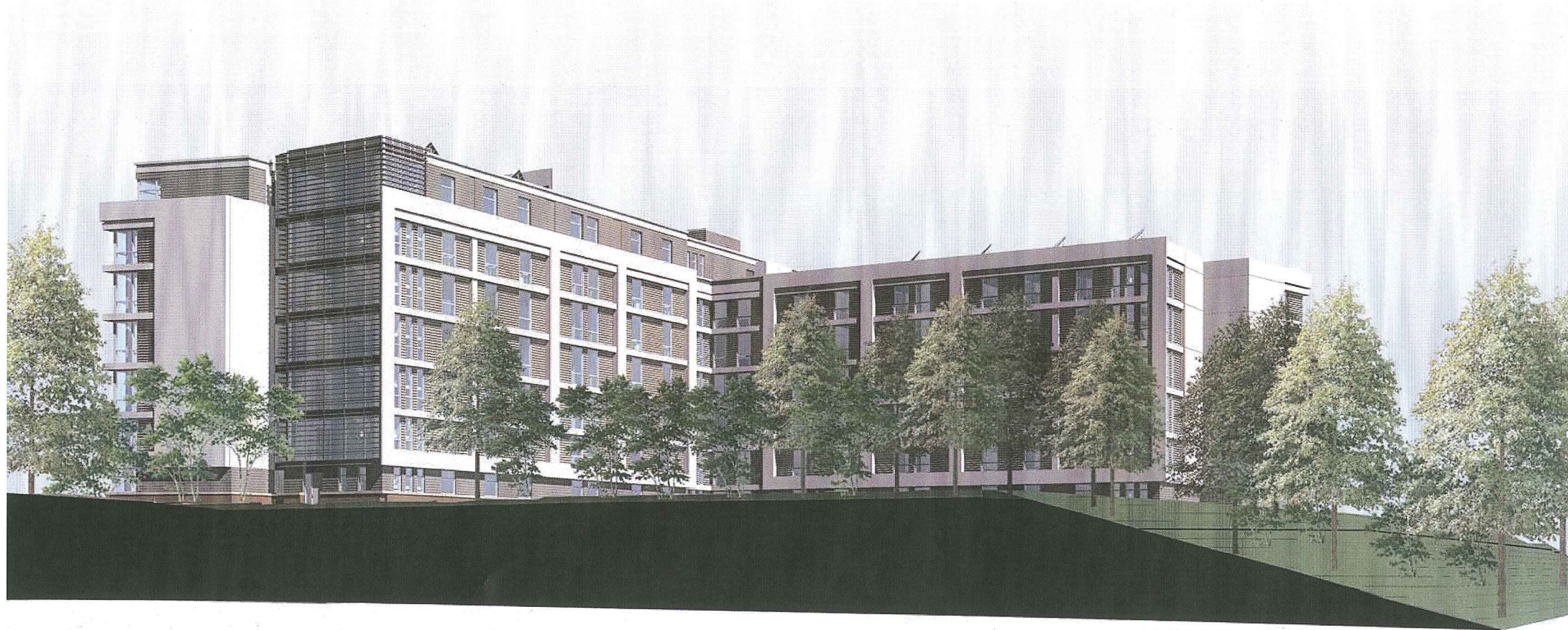
Image updated to show glazing condition at north stair wall (February 23, 2012) (previous version submitted October 20, 2011)