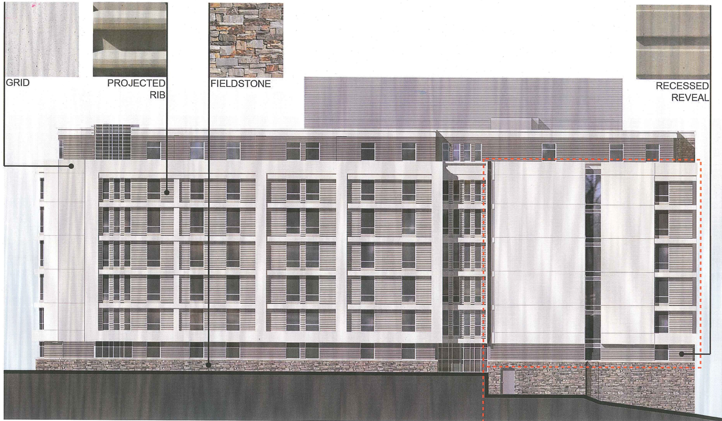
Image with updated Northwest corner window and stair curtain-wall configuration