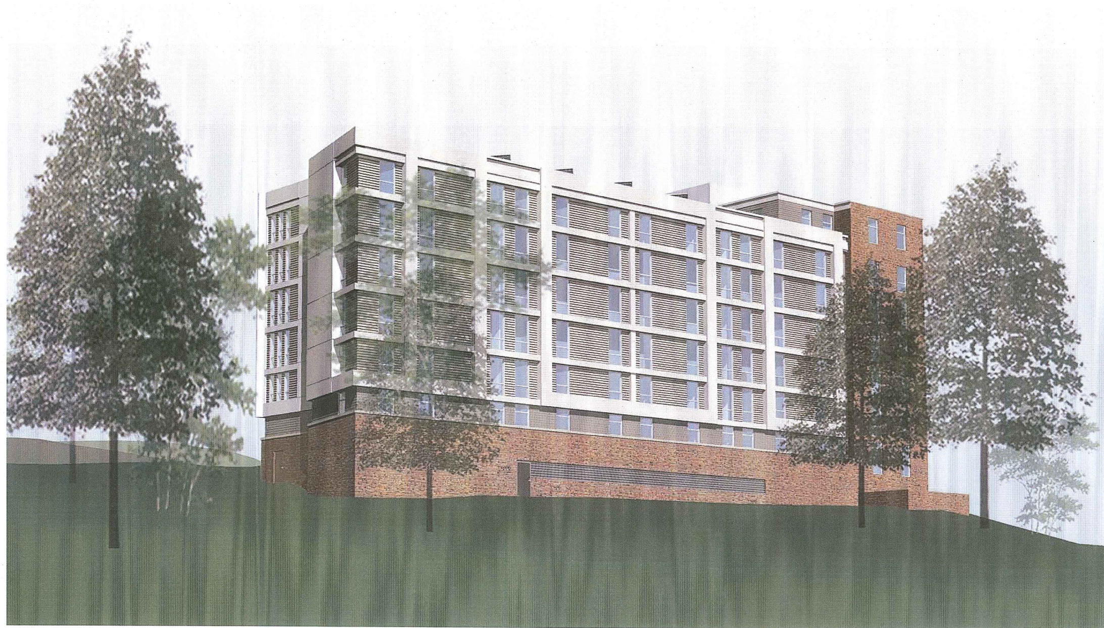
Additional view of north stair wall (February 23, 2012)