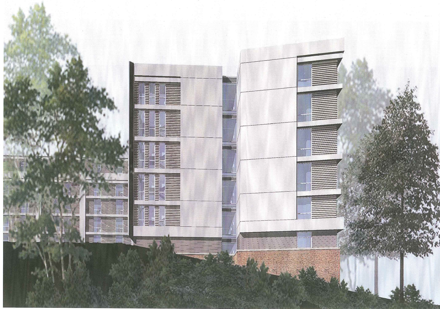
Additional view of north stair wall (February 23, 2012)