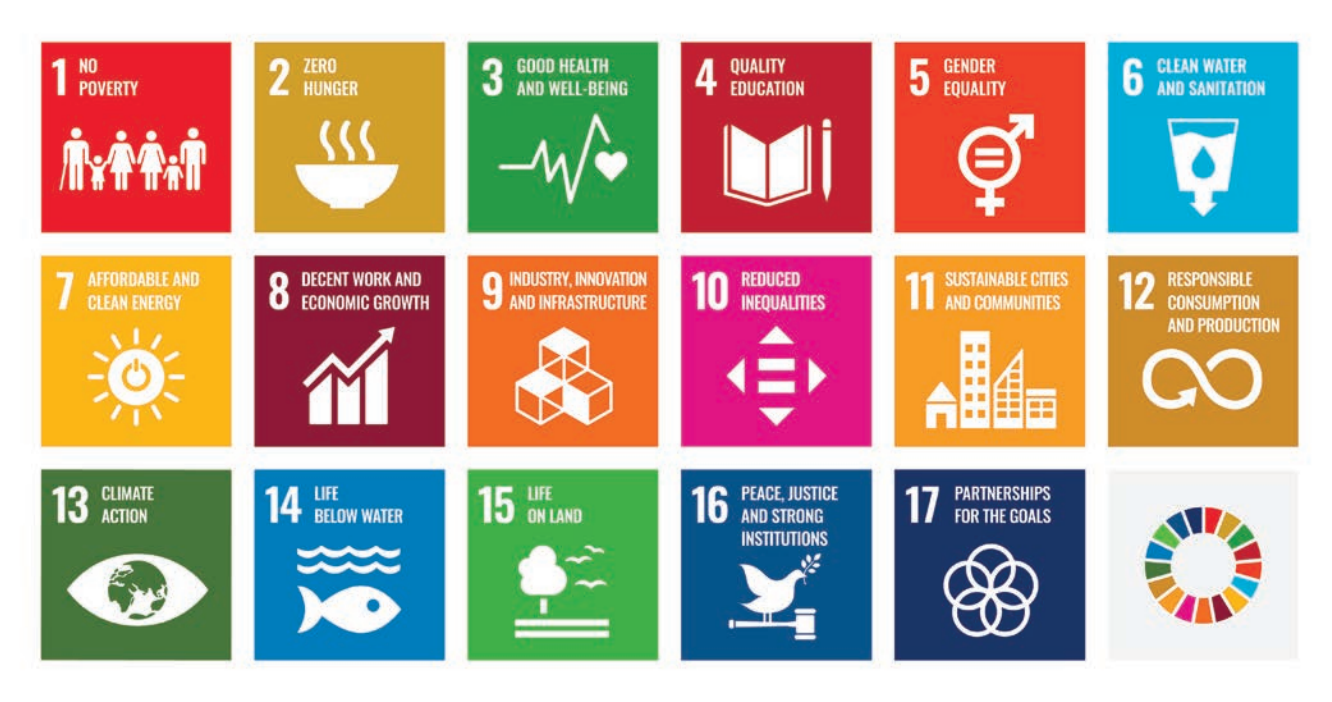
Figure 2. Icons and titles for the Sustainable Development Goals.

approaches to carbon removal because of how long it will take to research, develop, and scale most approaches. The indicators, however, provide metrics that can be used on any timeframe. Thus, the SDGs and their respective indicators represent a publicly negotiated global consensus on what matters most for social and environmental sustainability. This makes them appropriate benchmarks for scientific assessments of the sustainability of negative emissions technologies.