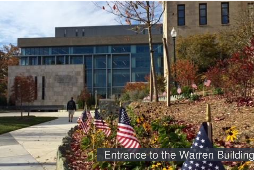
Entrance to the Warren Building

At the beginning of the spring semester, the American University Washington College of Law transitioned into the newly constructed Tenley Campus. This move situates our school in the Tenleytown neighborhood with quick access to the Metro Red Line. Our new location has allowed our students to intern frequently and easily and to attend conferences in downtown DC. It has also enhanced our programming because of the quick trip from agencies, businesses, and firms in the metro area.