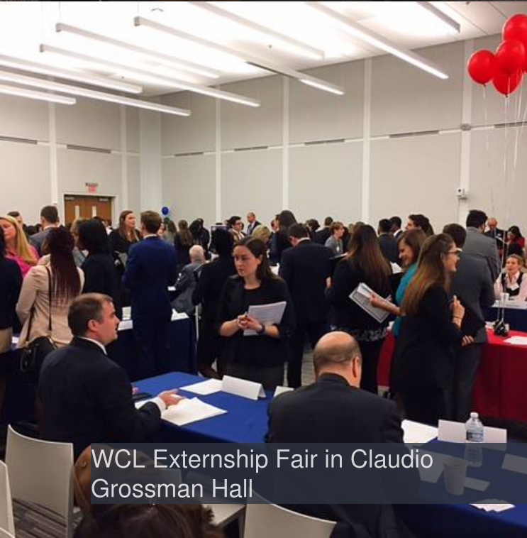
WCL Externship Fair in Claudio Grossman Hall

Each year the Business Law Program develops programming to assist students with developing a career plan for post-graduate employment. Annual events include receptions at DC law firms, panels presenting the different areas of practice in business law, resume review sessions, networking events with WCL alumni, and externship career fairs.