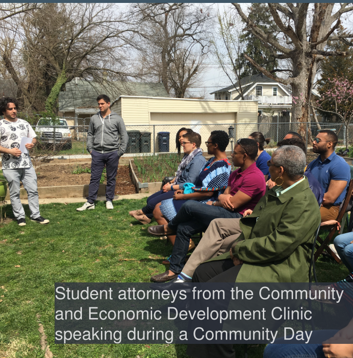
Student attorneys from the Community and Economic Development Clinic speaking during a Community Day