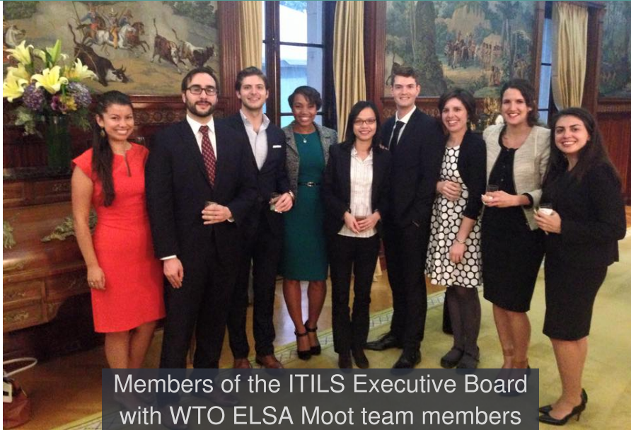
Members of the ITILS Executive Board with WTO ELSA Moot team members