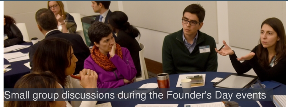
Small group discussions during the Founder's Day events