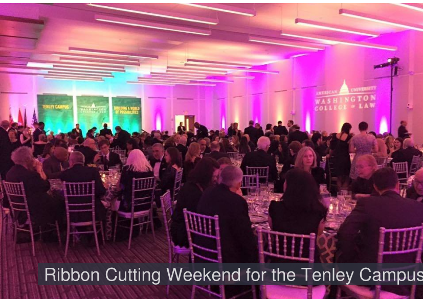
Ribbon Cutting Weekend for the Tenley Campus

The Business Law Program was exceptionally busy during the 2015–2016 academic year. The program hosted events addressing the latest topics with prominent experts and leaders. In one particular highlight, the law school welcomed World Bank President Dr. Jim Yong Kim. Summaries and photographs of this and some of the other events appear here and in the following pages.